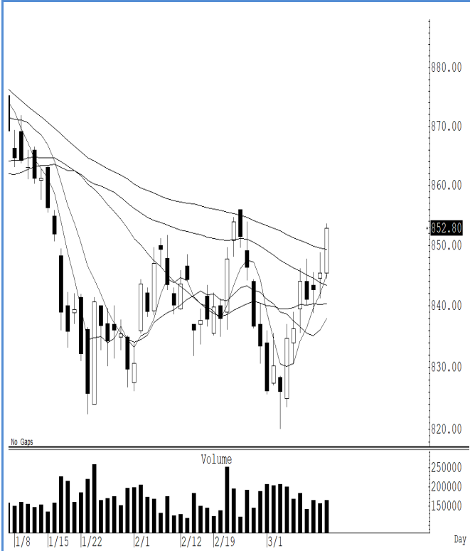
S50H24 (Close 845.40 Chg 2.70)